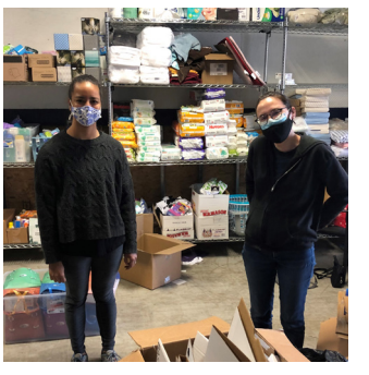
Students from Yale University helped with organizing in-kind donations.