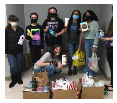
Betsy Ross Arts Magnet School students organized a toiletries and money for mattress drive.