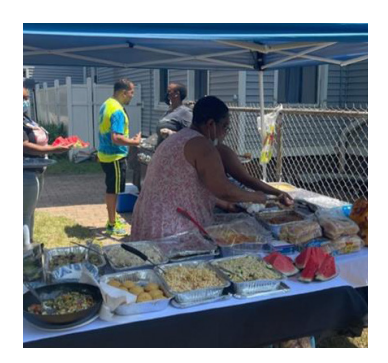
United Way's Women United organized a BBQ at Martha's Place for the families.

We are so thankful for all that our donors and volunteers do. Your commitment and generosity means the world to the people we serve. Thank you!