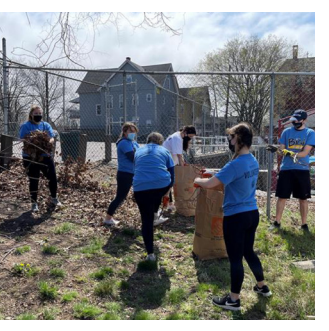
Students from Quinnipiac University helped with cleaning up the yard at Life Haven.